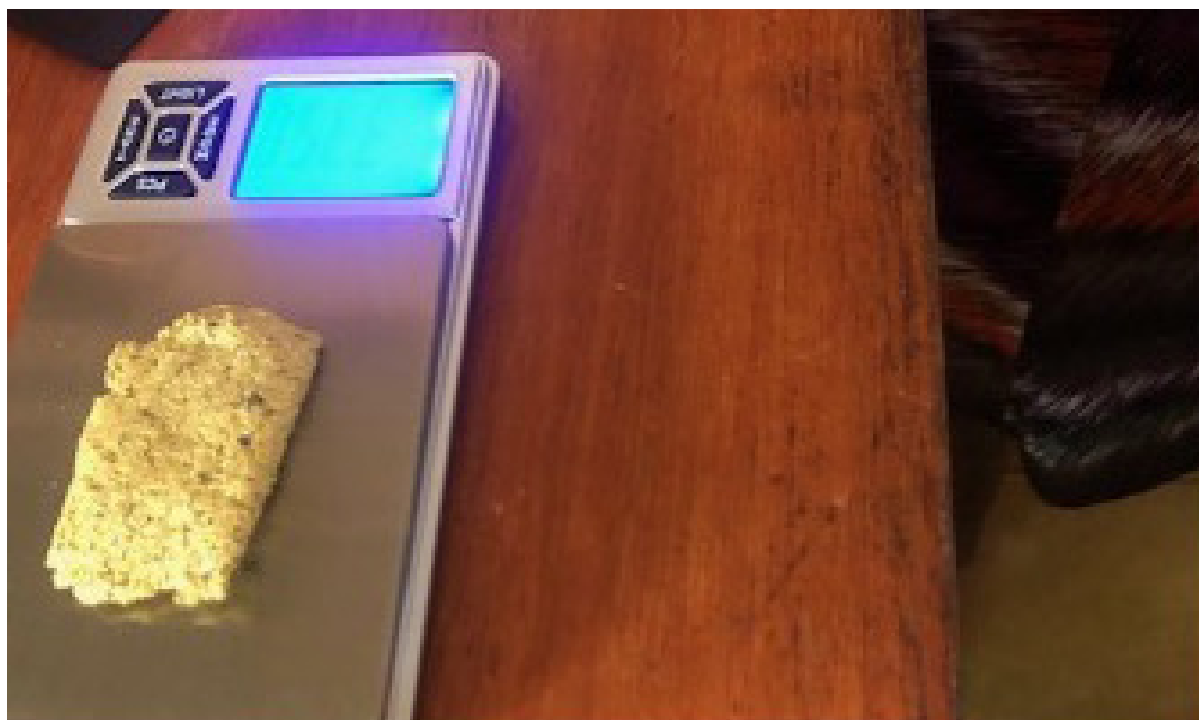
FIGURE 8. Digital scale in Guyana

ASM-mined minerals and metals are sold in a variety of ways. In a number of countries, governments have set up buying centres where they evaluate mineral products and buy from registered miners. For example, the Entreprise Générale du Cobalt in the DRC was established to buy cobalt from ASM operators, and the state mining company in Chile, Empresa Nacional de Minería (ENAMI) , buys ores or concentrate from small-scale copper miners. In Ghana, the state-owned Precious Minerals Marketing Company buys gold and diamonds from artisanal miners. In Zimbabwe, Fidelity Printers and Refiners , wholly owned by the Reserve Bank of Zimbabwe, buys gold produced by artisanal miners, and the Minerals Marketing Corporation of Zimbabwe facilitates access to the market for other minerals produced by artisanal miners, such as chromite, tin, tantalite, and tungsten. Government buying centres employ diverse analytical techniques, including microscopes, atomic absorption spectrometers, fire assay facilities, and X-ray fluorescent spectrometers (XRF), to assess material grade, 13 determine prices, and enhance traceability 14 within the supply chain.